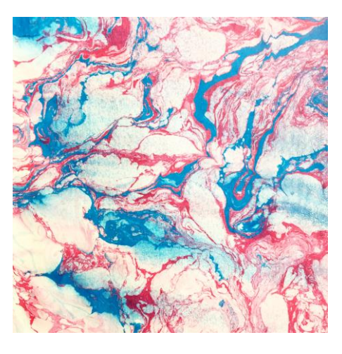
In water (without the marbling bath)