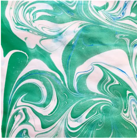
With the marbling bath

Marbling paints can also be used in water without a marbling bath. The marbled effect is then narrower and the shades more pastel.